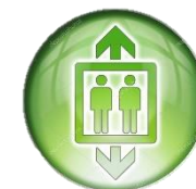
Transport of persons In dynamic mode